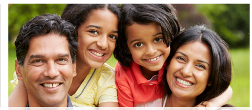
More Family Time